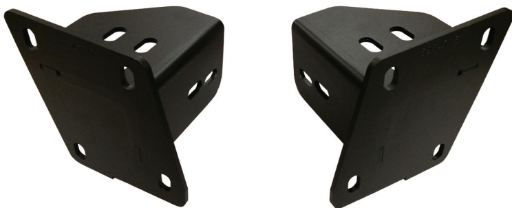
Brackets #59647-6 & #59647-5