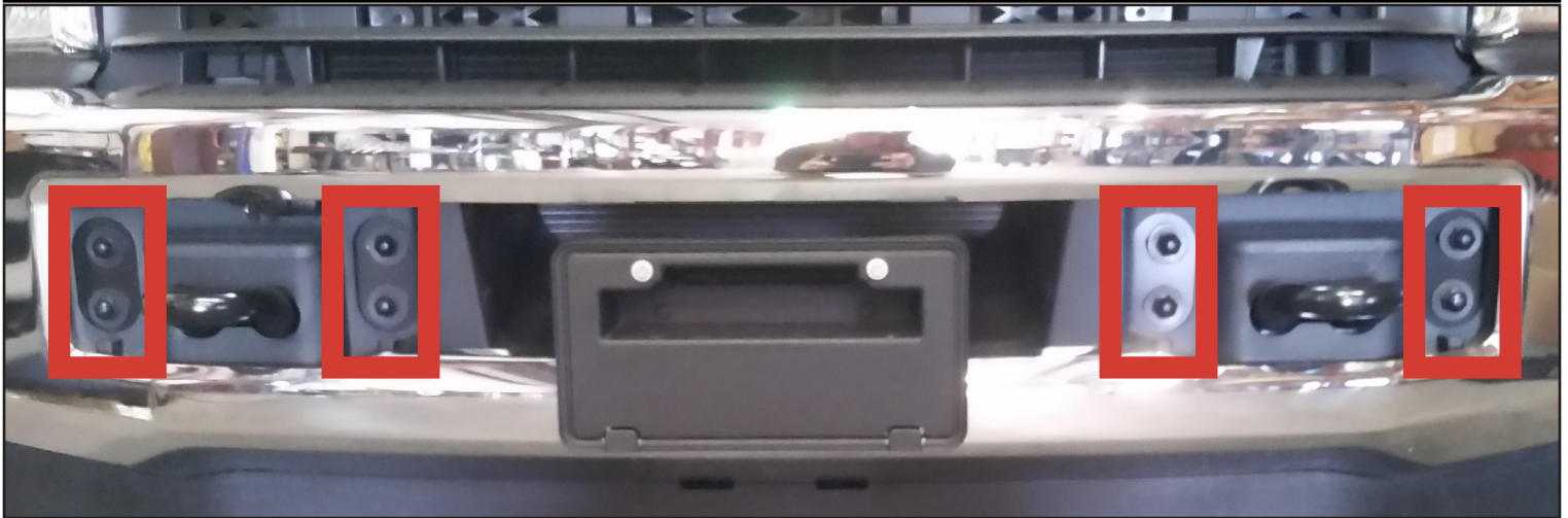
Front Bumper Mounting Bolts